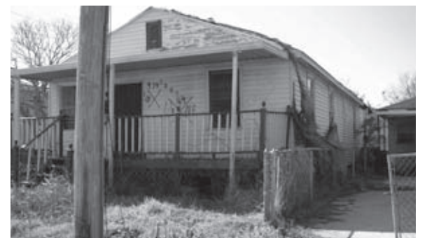
The marks of the original search parties are still visible on this house still standing nearly two and a half years after Katrina hit.