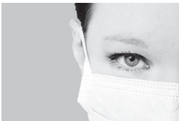
Launched in 2006 by Carlow's Women of Spirit® Institute, Prepare to Care is a three-day summer workshop for high school girls who are interested in healthcare professions and also want to explore college life.