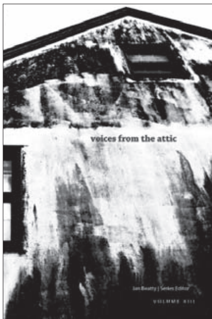
Voices from the Attic, Volume XIII.

The Carlow University Press just released the thirteenth volume of Voices from the Attic , a compilation of writings by participants in the Madwomen in the Attic Workshop in Poetry and Fiction during fall and spring 2006.