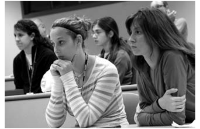
Carlow students listen intently to presentations by Carlow alumni.