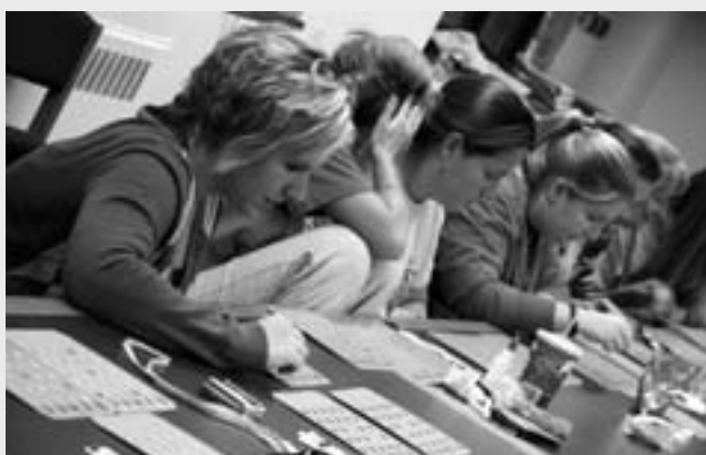
Students intently watch their cards during the bingo game.