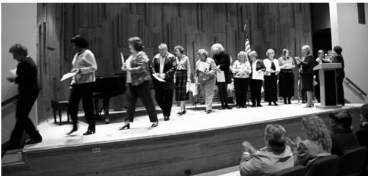
Carlow staff and faculty applaud their colleagues for their years of service.